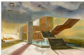
Angelina Gualdoni's "Letter From the Generations" (2006).

More motorized architectural elements are the focus of Alexander Apóstol's video of the interior of the 1956 Villa Planchart in Caracas, Venezuela, designed by the Italian architect Gio Ponti. Two video monitors show how the architect incorporated rotating panels of shelves into a wall, the panels hiding and revealing the owner's hunting trophies — the heads of four large stuffed animals. More than just making you feel at home, the use of motorized architectural elements here has the power to whisk you away to a hunter's cabin in the wilderness.